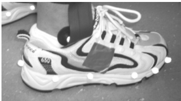
Figure 1. Ten markers (15 mm) affixed around the periphery of a running shoe were used to track insole sensor positions.

Pressure sensitive insoles have emerged as a powerful tool for assessing the pressure distribution on the sole of a foot. The pressures measured by the insole sensors can also be combined to determine a partial set of net ground reactions (COP-center of pressure, vGRF - vertical ground reaction force) (Barnett, et.al , 2000, Chesnin, et.al , 2000). Such information could conceivably be used within a least-squares inverse dynamics approach (Kuo, 1998) to estimate joint kinetics, thereby providing an alternative to fixed forceplates. However, using insoles for inverse dynamics analysis would require the global position of the insole sensors be tracked with high fidelity. This is a challenging requirement to achieve since the flexible insoles are embedded in a shoe which can undergo large motion and deformations. The objective of this study was to develop and evaluate the use of an array of motion capture markers affixed to a shoe to track insole sensor positions during walking and running. The accuracy of the approach was assessed by comparing the estimated position of the COP and the net vGRF with values measured using a fixed forceplate.